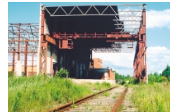
9. Railway link