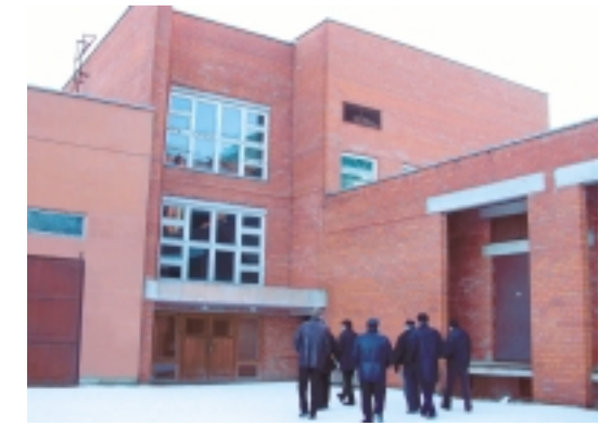
2. Administrative offices