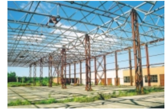
4. Warehouse under construction