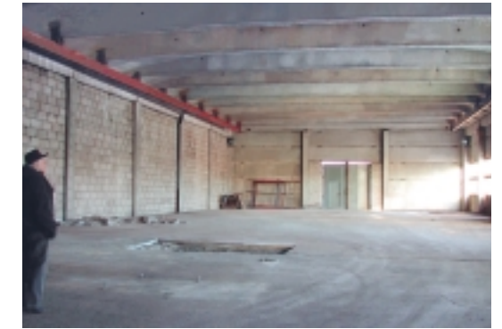
3. Repair and maintenance workshop