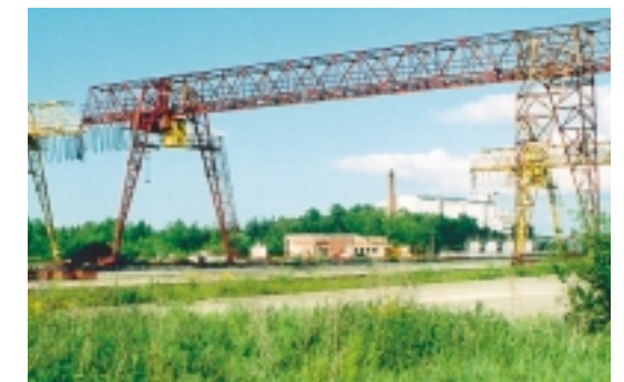
7. Mechanical stockyard